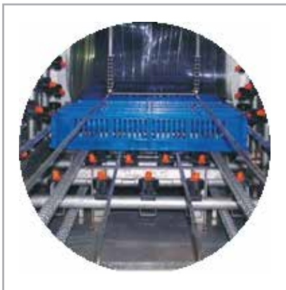
Clip eyelet nozzles